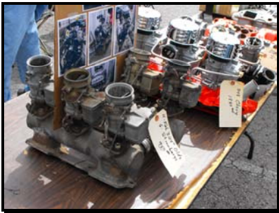
Street Rod stuff for the guys. . .