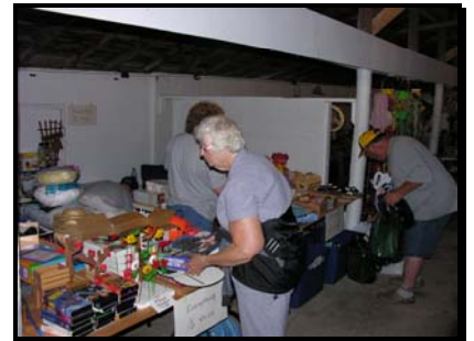
. . .crafts & collectibles for the ladies!!